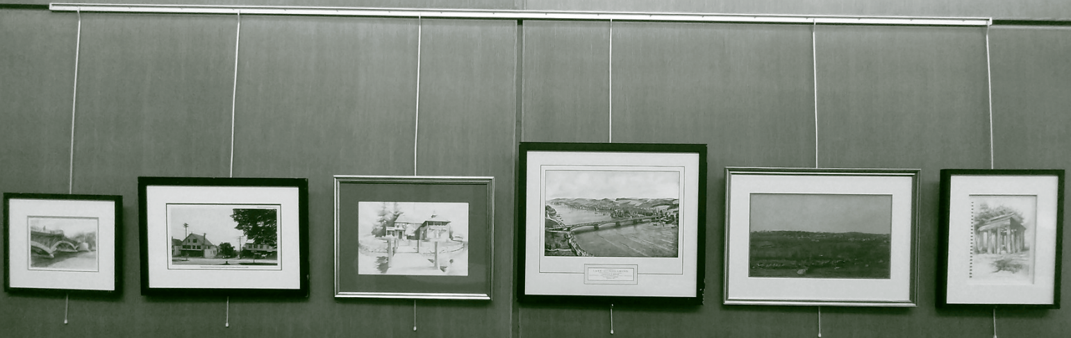
The community art display in the Community Commons

THE NEWSLETTER OF THE SHREWSBURY PUBLIC LIBRARY — SPRING 2022