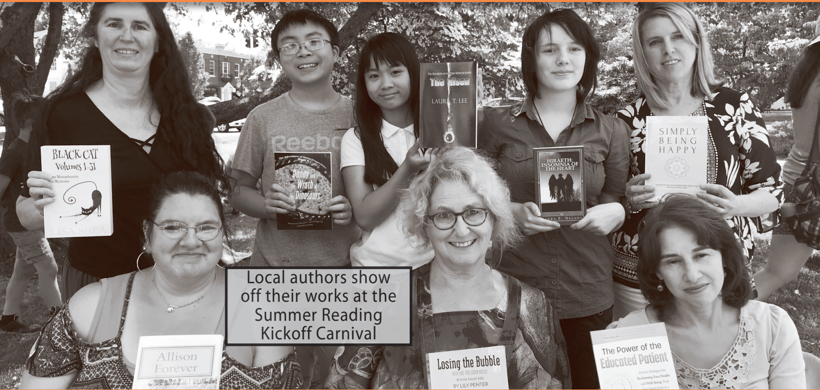
Local authors show off their works at the Summer Reading Kickoff Carnival